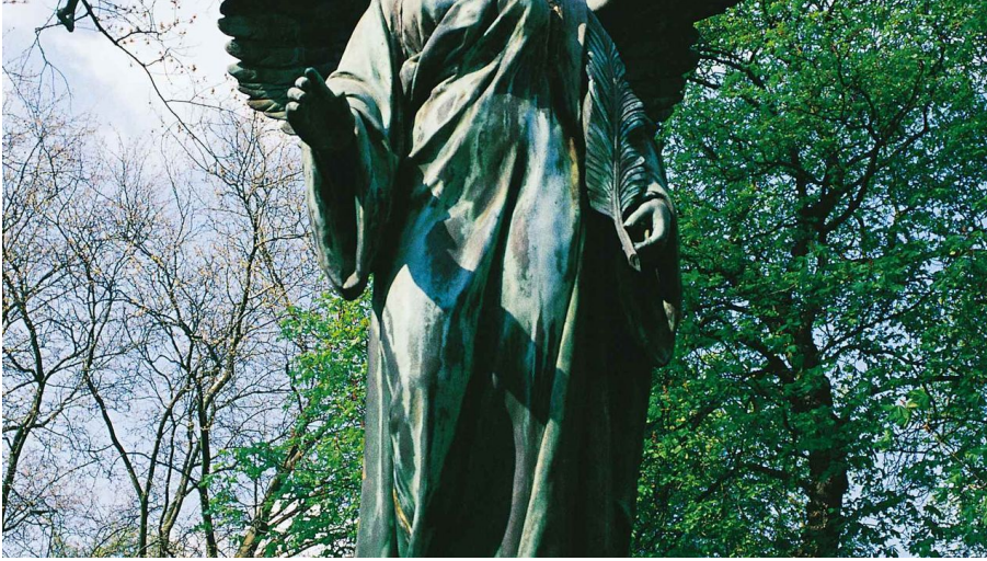
koelnerfoto - koelnerfoto