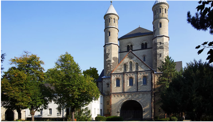
Udo Haake - Udo Haake