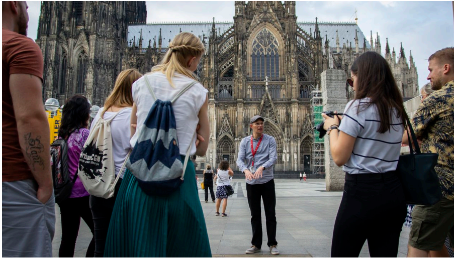
KölnTourismus GmbH - Bilderblitz