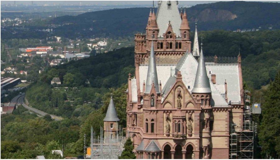
Tourismus Siebengebirge - Tourismus Siebengebirge