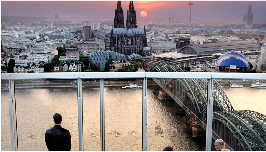
Axel Schulten - Axel Schulten