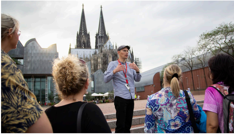
KölnTourismus GmbH - bilderblitz