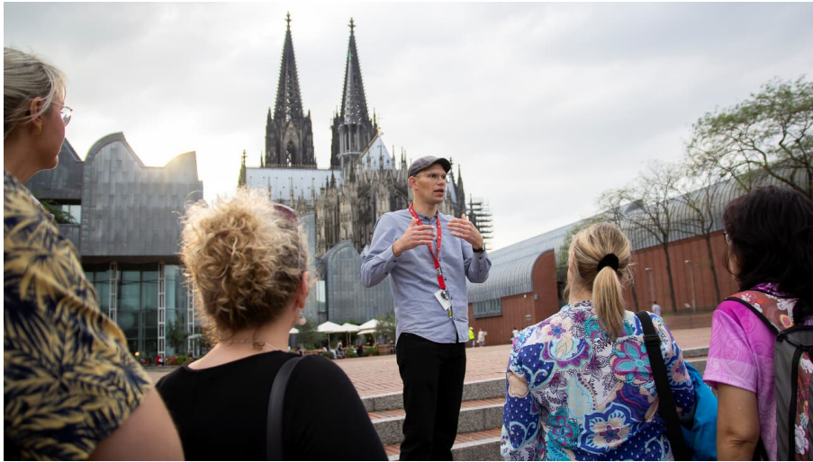
KölnTourismus GmbH - bilderblitz