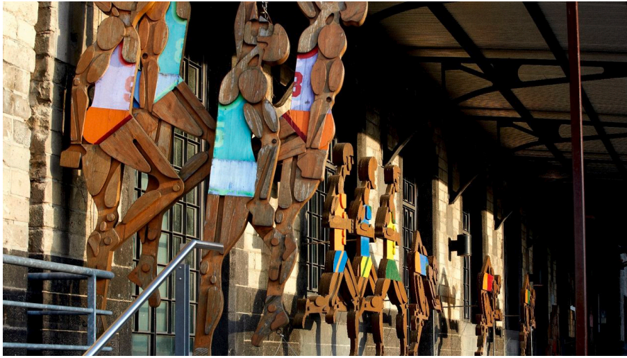
tomas - Axel Schulten