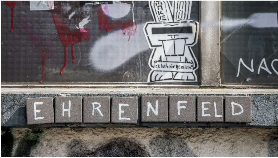
Bilderblitz - Bilderblitz