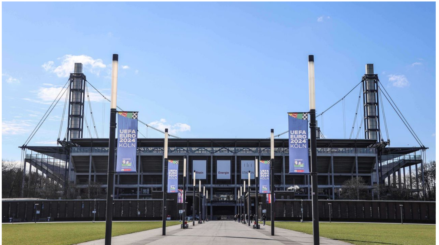
Sportplatz der Stadt Köln

Sonntag, 30.06.2024, 21:00 - Montag, 01.07.2024, 22:45 Uhr