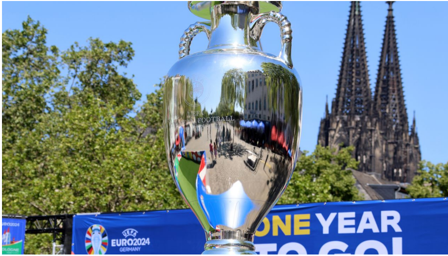
Sportamt der Stadt Köln