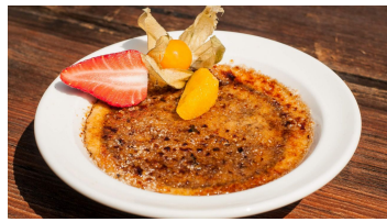
Seerestaurant Löwen, Brienz