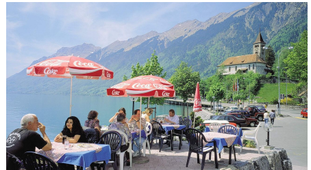
Seerestaurant Löwen, Brienz