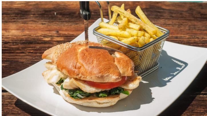
Seerestaurant Löwen, Brienz