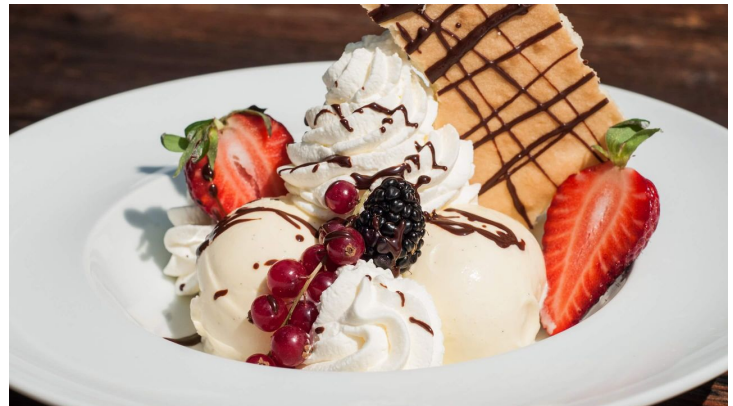
Seerestaurant Löwen, Brienz, Interlaken Tourismus - web@interlaketourism.ch