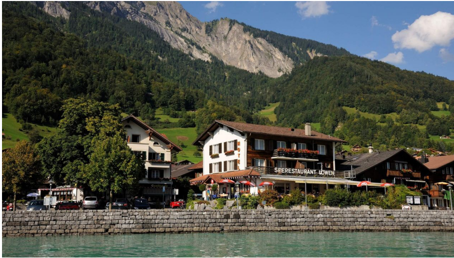
Seerestaurant Löwen, Brienz, Interlaken Tourismus - web@interlaketourismus.ch