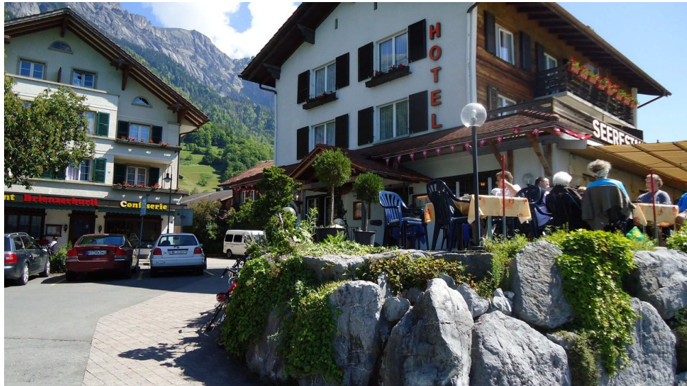
Seerestaurant Löwen, Brienz