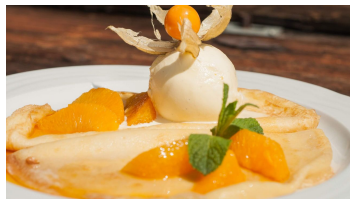
Seerestaurant Löwen, Brienz