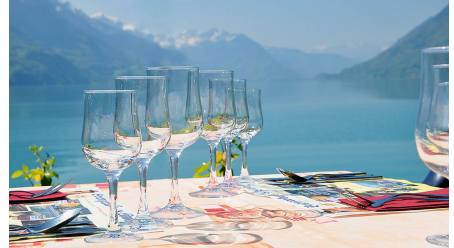
Seerestaurant Löwen, Brienz