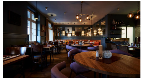
Hotel Spedition, Thun