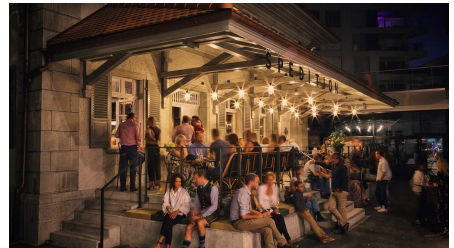
Hotel Spedition, Thun