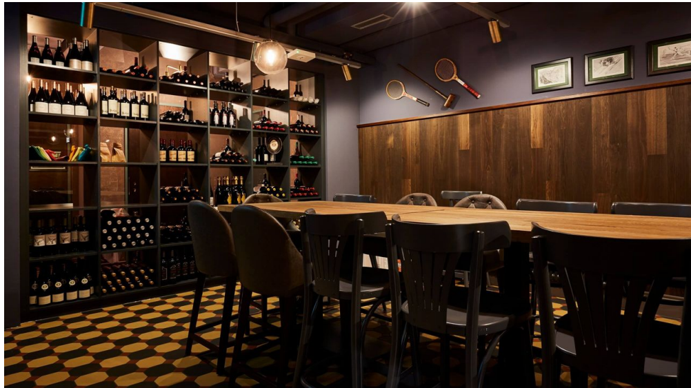
Hotel Spedition, Thun, Interlaken Tourismus - web@interlaketourism.ch