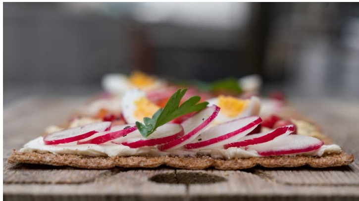
Hotel Spedition, Thun