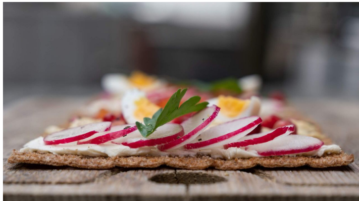
Hotel Spedition, Thun, Interlaken Tourismus - web@interlaketourism.ch