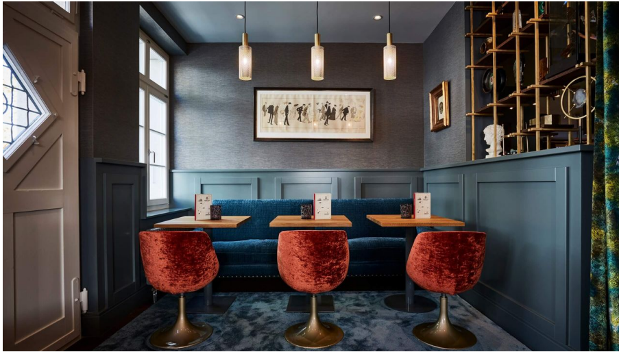
Hotel Spedition, Thun