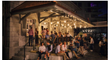
Hotel Spedition, Thun