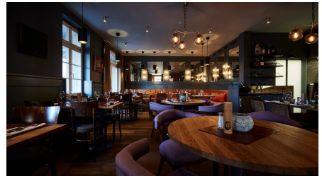
Hotel Spedition, Thun