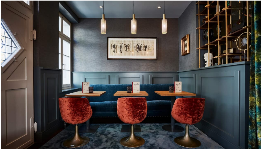
Hotel Spedition, Thun