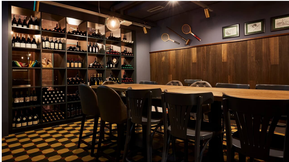
Hotel Spedition, Thun