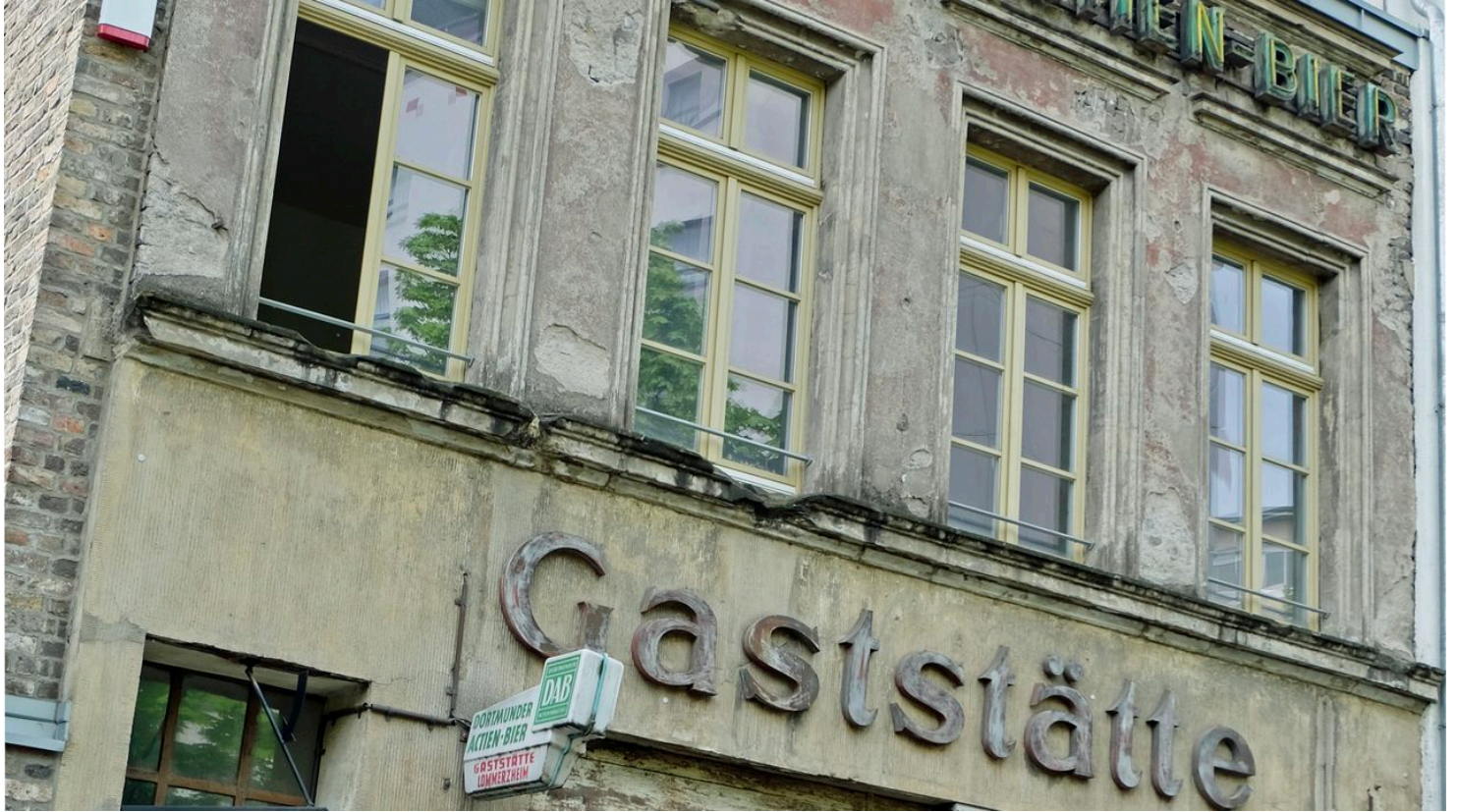
KölnTourismus