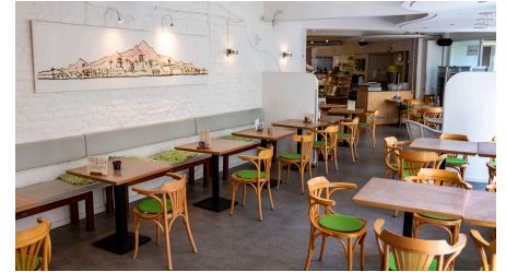
KölnTourismus, Foto: Christoph Seelbach