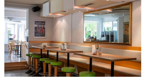
KölnTourismus, Foto: Christoph Seelbach