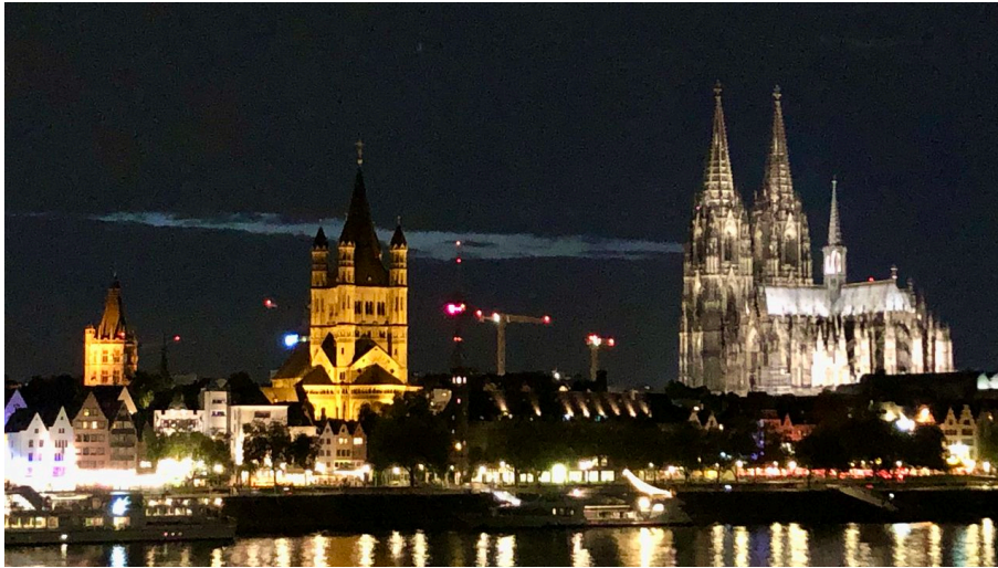
Köln bei Nacht