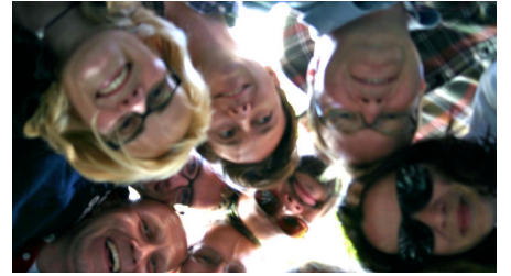
Auf geht's - Team Köln