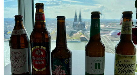
Kölschtasting - © Stephanie Biernat