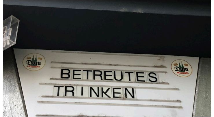
Kölschtasting