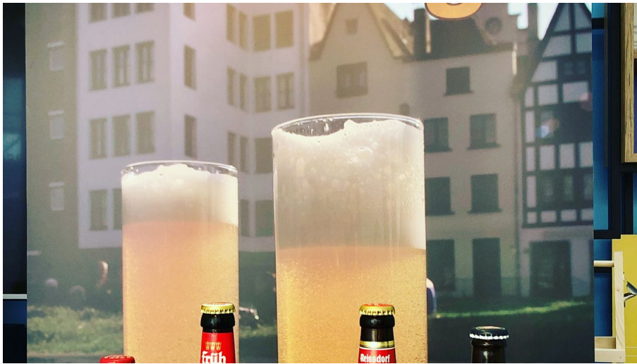
KölschTasting - © Stephanie Biernat