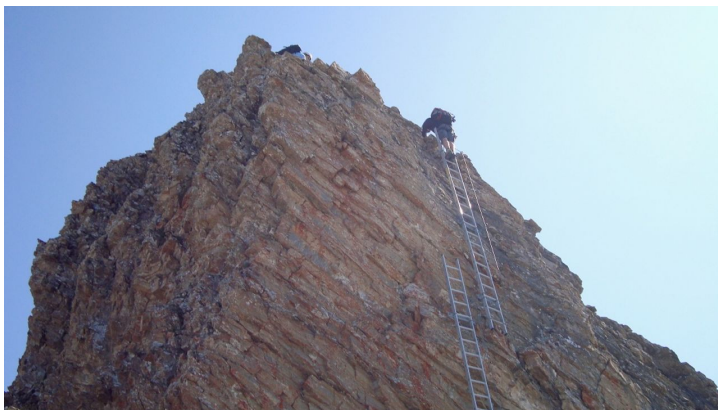
Jungfraubahnen Management AG