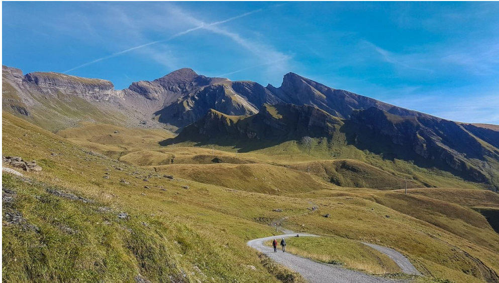
Schwarzhorn vom Distelboden aus gesehen