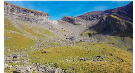
Grossi Chrinne