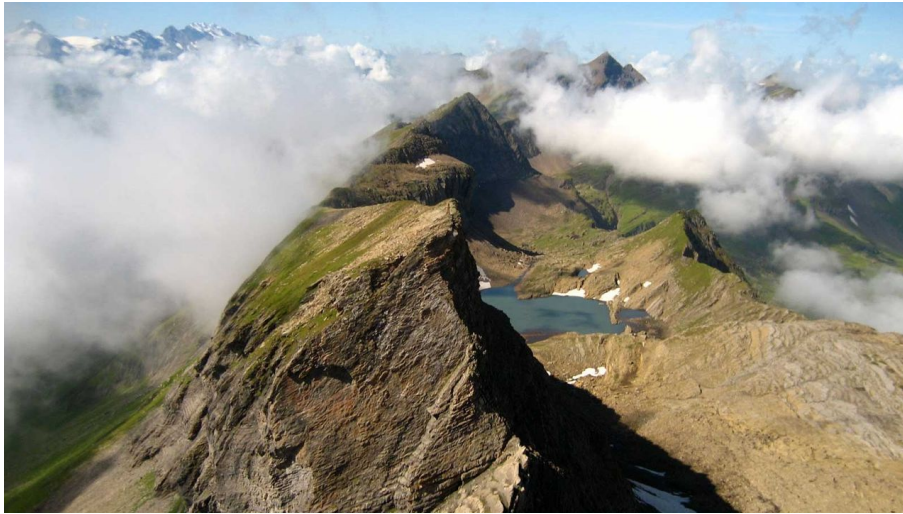
Jungfrauabnahmen Management AG