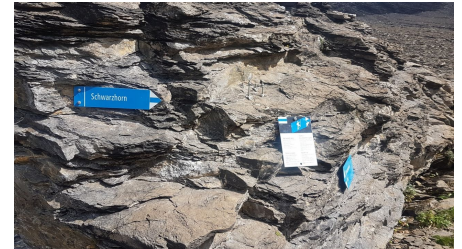
Achtung Wegweiser: Für die Wanderung rechts, für den Klettersteig (unbedingt) links abbiegen