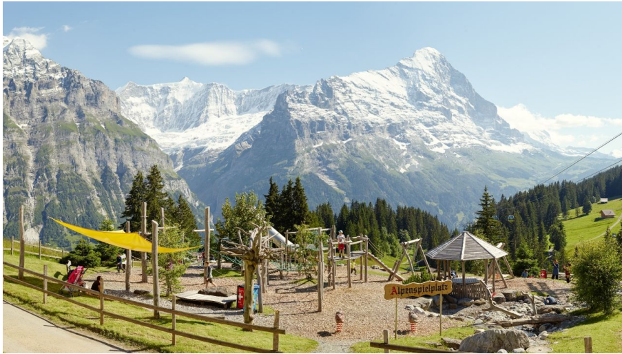
Jungfrauabahren Management AG