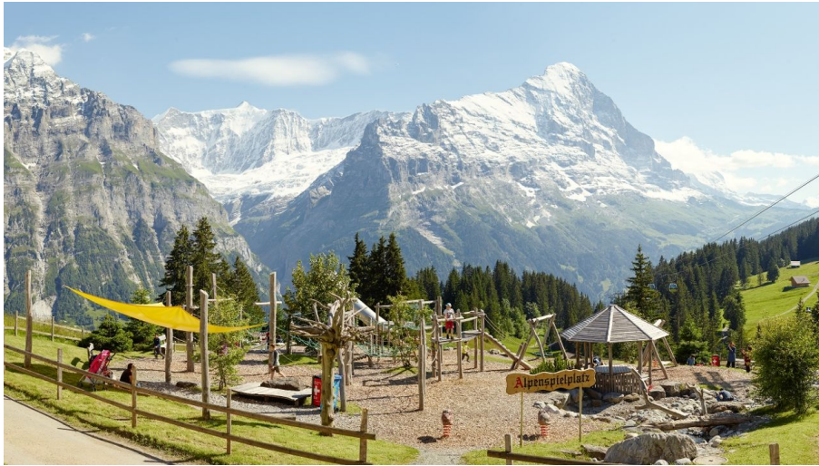
Jungfrauabahn Management AG