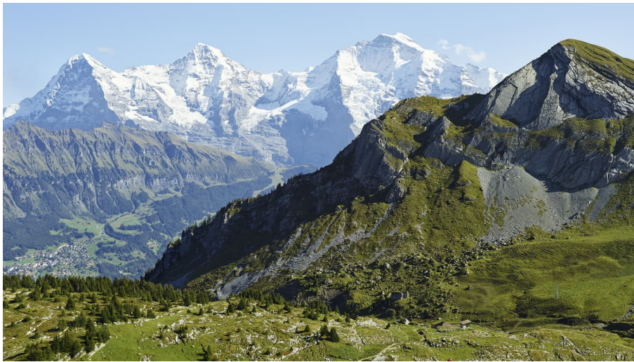
Jungfrauabnahmen Management AG