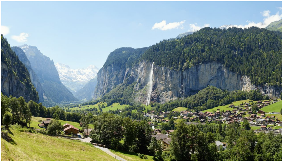
Jungfrauabnahmen Management AG