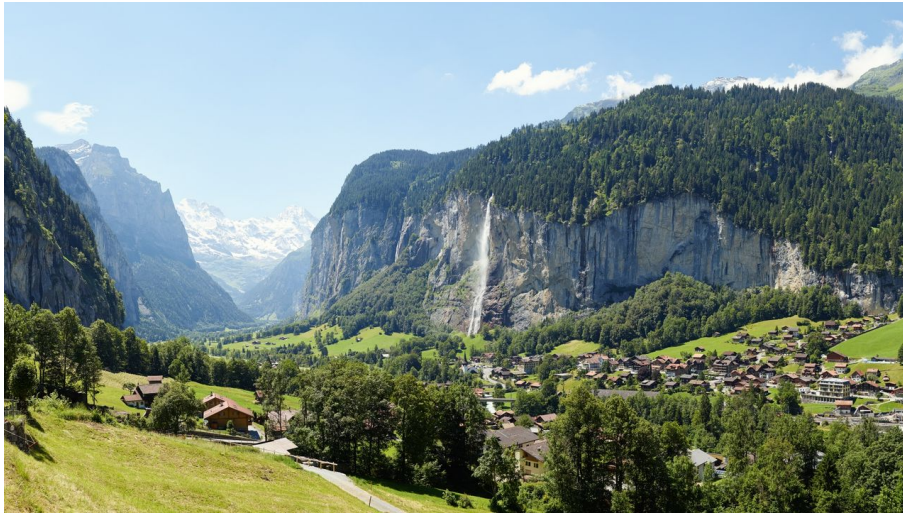
Jungfrauabnahmen Management AG