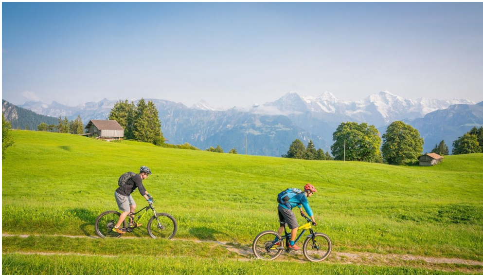
Aussichtsreiche Tour