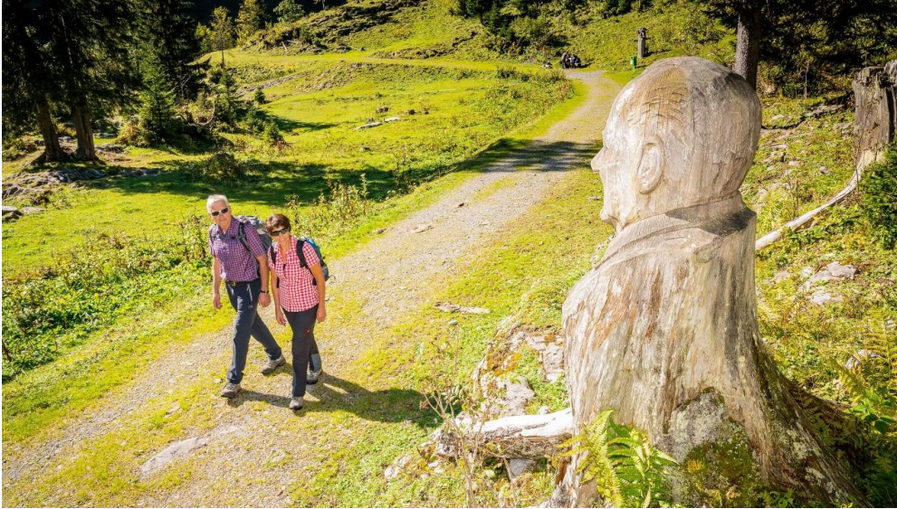
Wanderer auf dem Schnitzlerweg Axalp bei einer Skulptur - © Christian Mathyer, Interlaken Tourismus