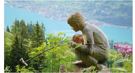
Woodcarving Trail