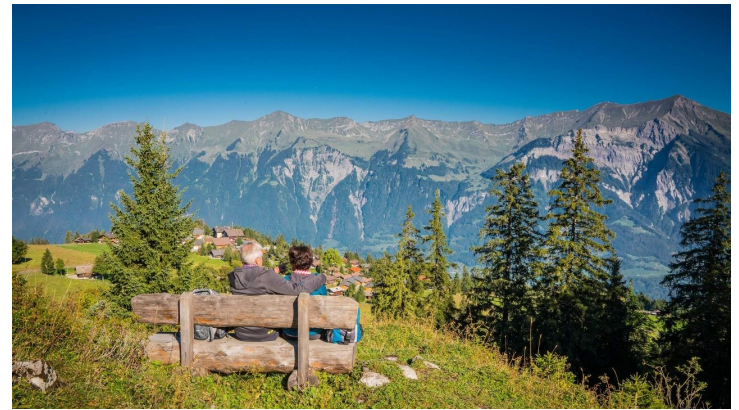
Ruhepause auf einer Holzbank, Schnitzlerweg Axalp