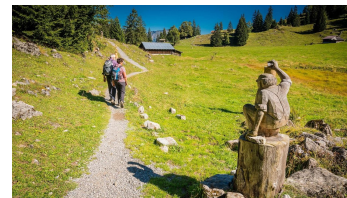
Wanderer auf dem Schnitzlerweg Axalp