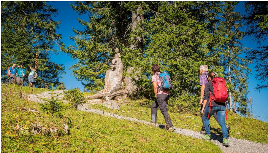
Wanderer auf dem Schnitzlerweg Axalp