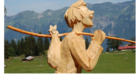
Woodcarving Trail on Axalp above Brienz