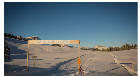
Melanie Studer, Interlaken Tourismus