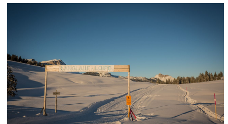
Melanie Studer, Interlaken Tourismus