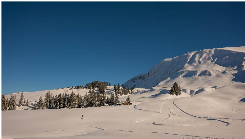
Melanie Studer, Interlaken Tourismus