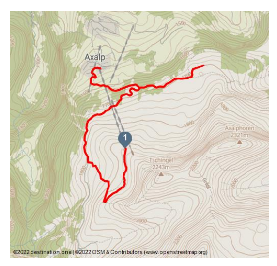
Melanie Studer, Interlaken Tourismus