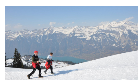
Melanie Studer, Interlaken Tourismus