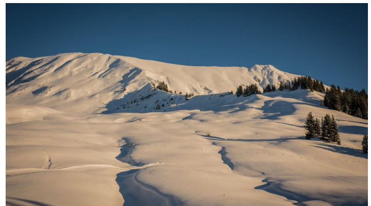
Melanie Studer, Interlaken Tourismus