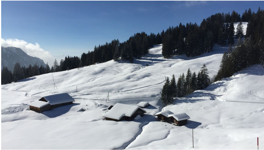
Melanie Studer, Interlaken Tourismus