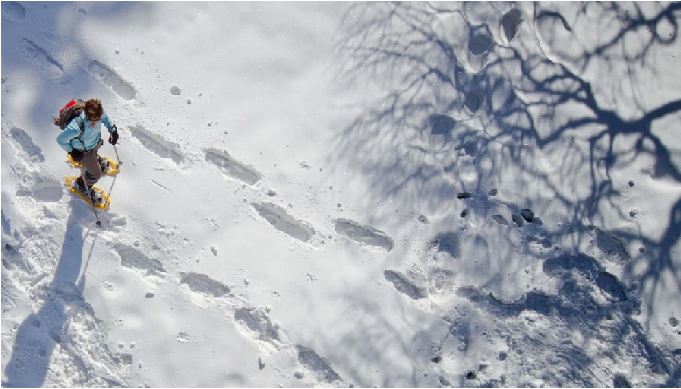
Mit Schneeschuhen unterwegs