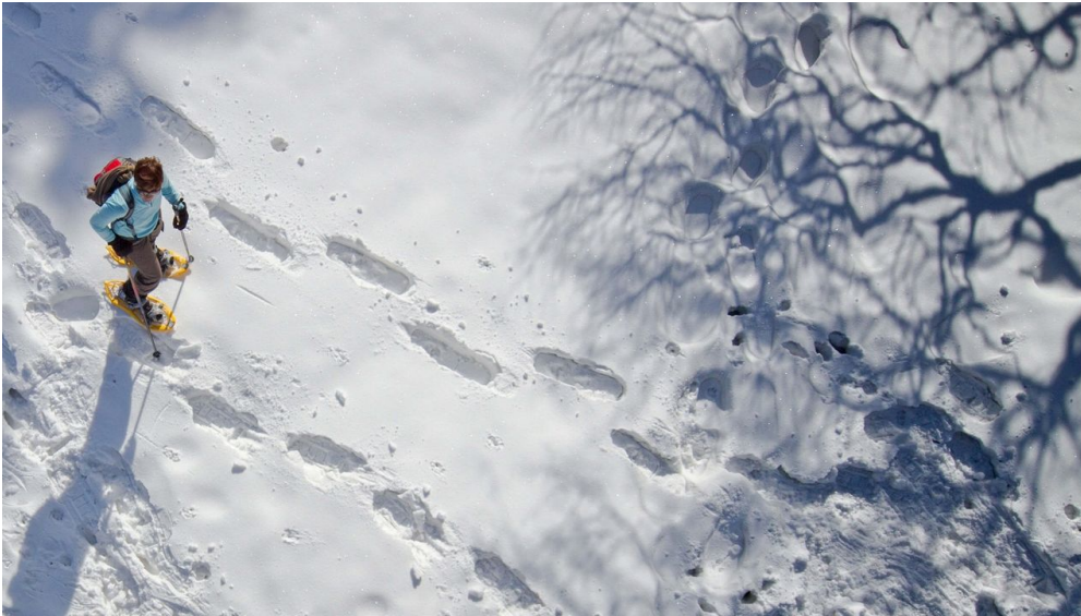
Mit Schneeschuhen unterwegs