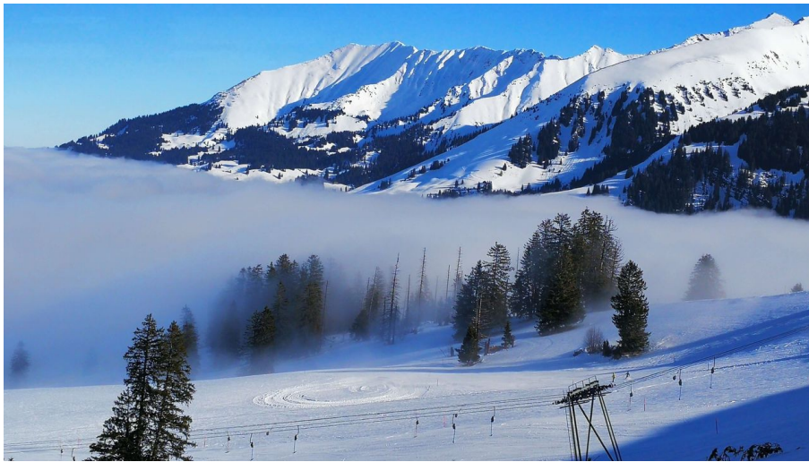
Faszinierende Weitsicht auf Niesenkette