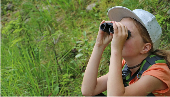
Welche Tiere entdeckst du? - © Rahel Mazenauer, Naturpark Diemtigtal