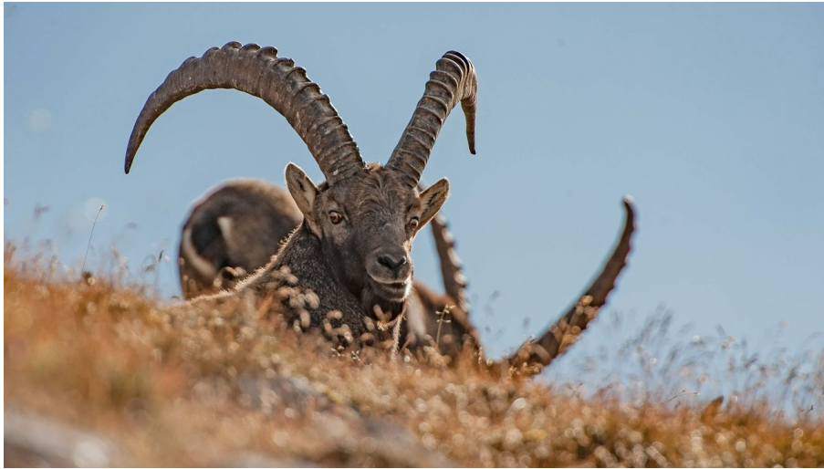
Mit etwas Glück entdeckst du ihn: den Steinbock