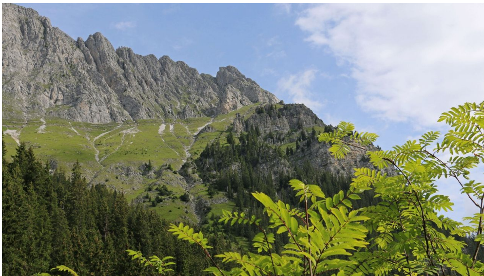
Blick ab Alpetli