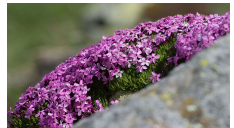
Geniesse unterwegs die Farbenpracht der Bergblumen