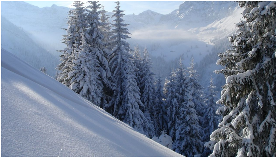
Grimmialp Trail