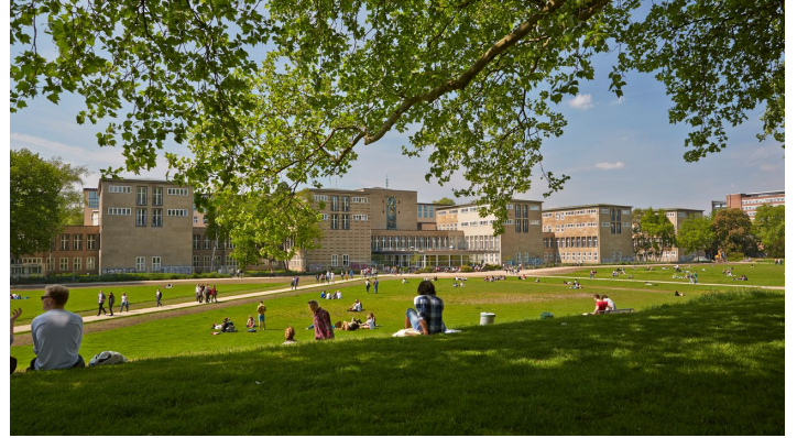
Axel Schulten, KölnTourismus GmbH