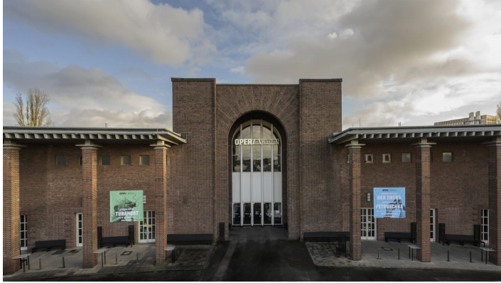
Oper Köln