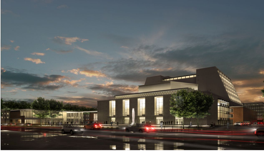
Oper Köln (Visualisierung)