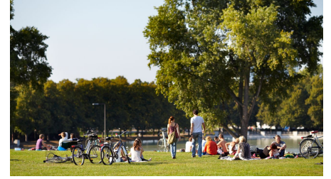
Aachener Weiher, Cologne