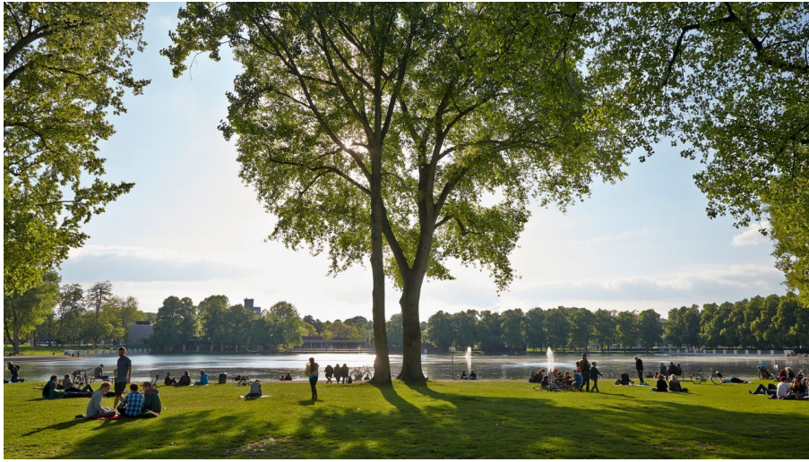
Axel Schulten, KölnTourismus GmbH