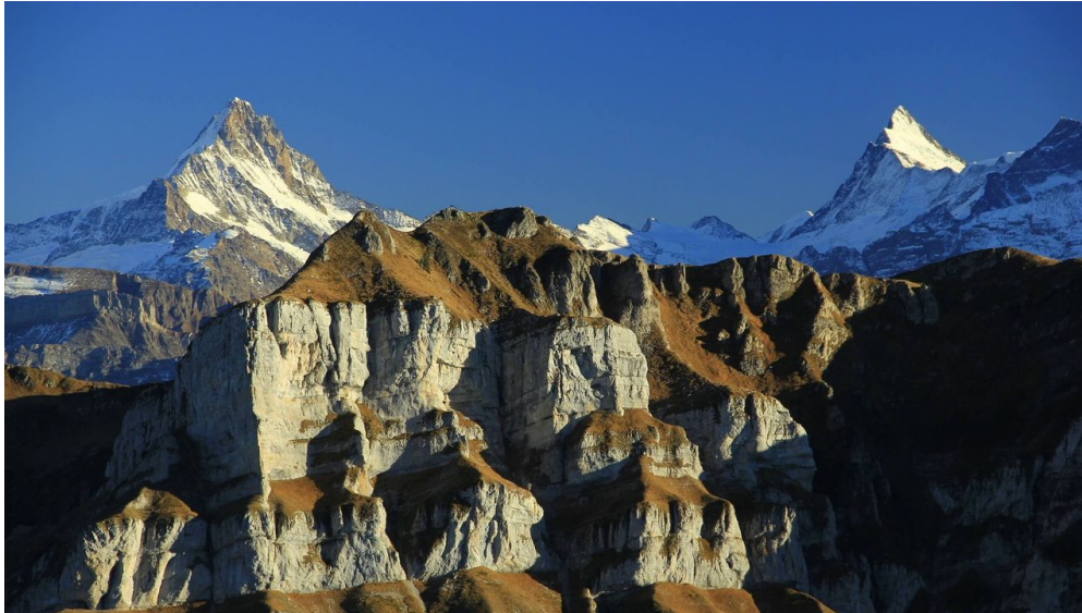
Interlaken Tourismus - web@interlakentourism.ch

_____ Beginning of September – beginning of October