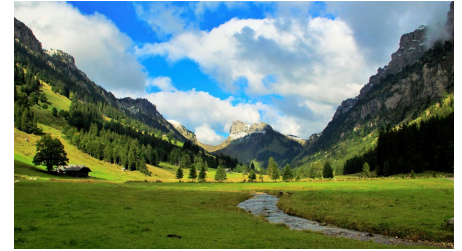
Interlaken Tourismus - web@interlakentourism.ch