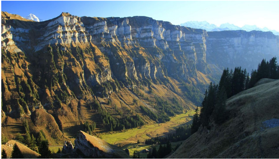
Interlaken Tourismus - web@interlaketourismus.ch

nature reserves guides alpine landscapes summer