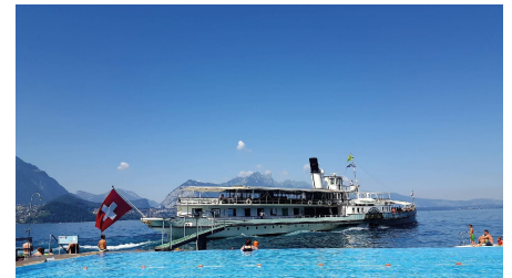
Strandbad Merligen