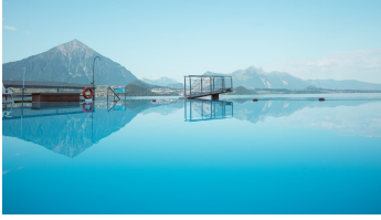
Strandbad Merligen