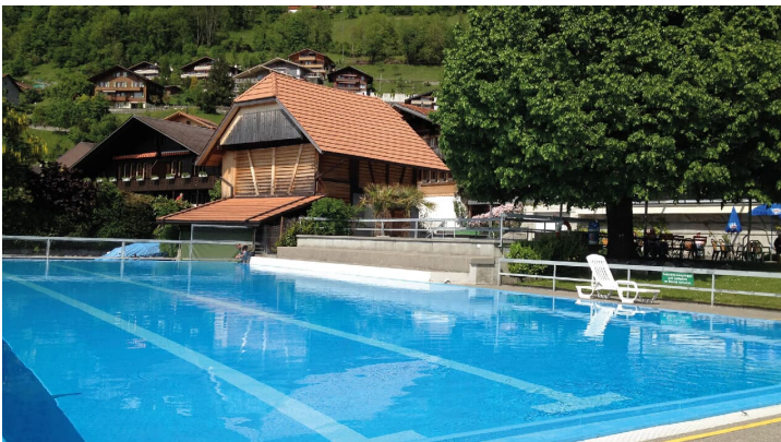
Strandbad Merligen