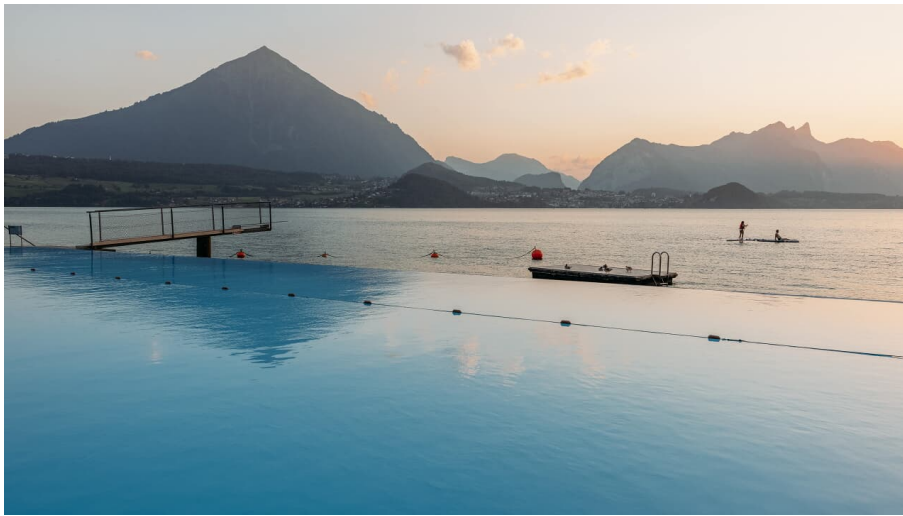
Strandbad Merligen