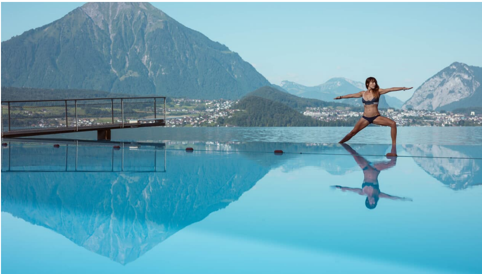
Strandbad Merligen

Mid-May - mid-September 09.30 - 19.00h. July - mid-August until 21.00h in good weather. Closed in bad weather.