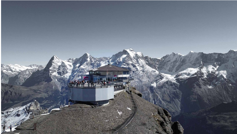
Schilthornbahnen AG, Interlaken Tourismus - web@interlaketourism.ch