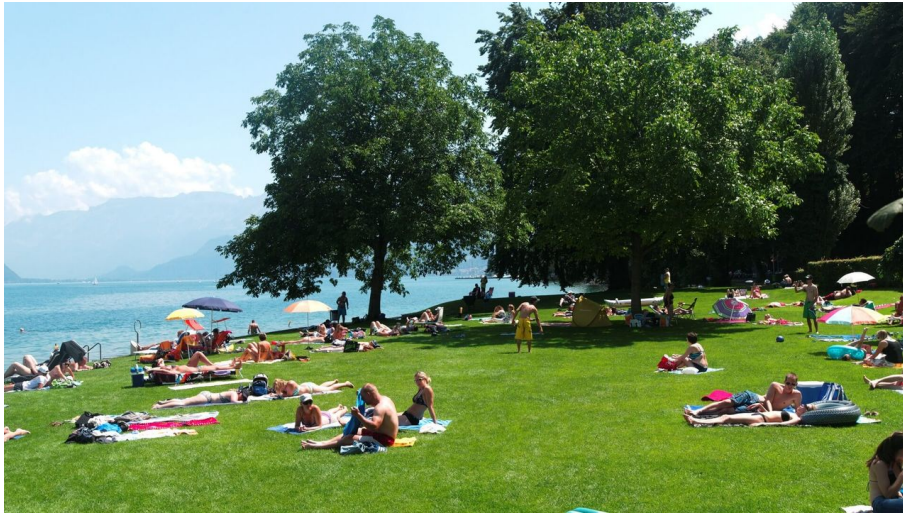
Strandbad Faulensee