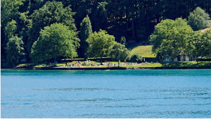
Strandbad Faulensee