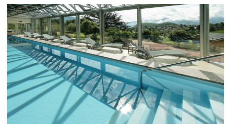
Hotel Eden, Spiez