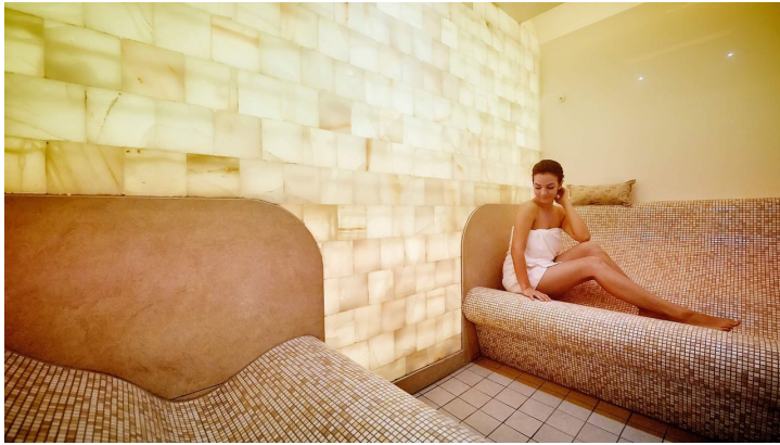
Hotel Eden, Spiez, Interlaken Tourismus - web@interlaktourism.ch