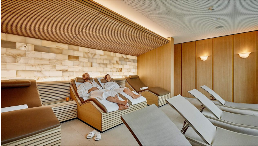
Hotel Eden, Spiez