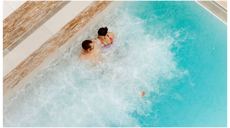
Hotel Eden, Spiez