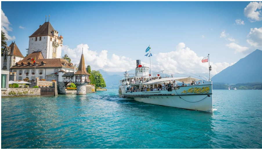
Tourismus-Organisation Interlaken, Interlaken Tourismus - web@interlaketourism.ch