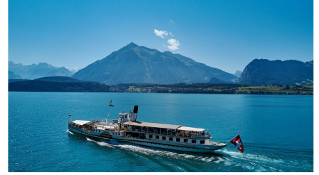
BLS Schifffahrt AG, Interlaken Tourismus - web@interlakentourism.ch