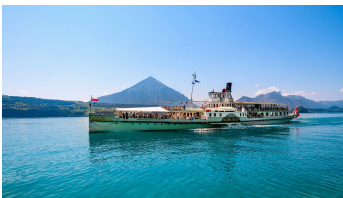
BLS Schifffahrt AG, Interlaken Tourismus - web@interlakentourism.ch