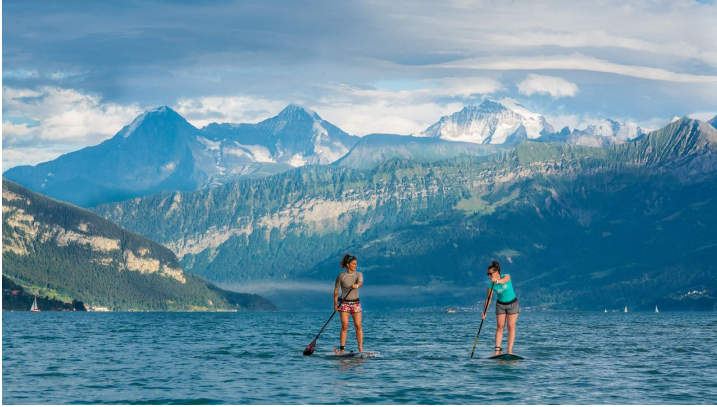
Honu SUP Center