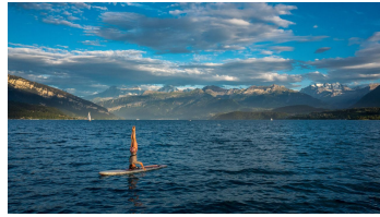
Honu Wassersportcenter