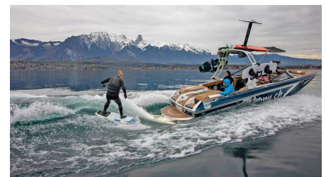
Honu Wassersportcenter