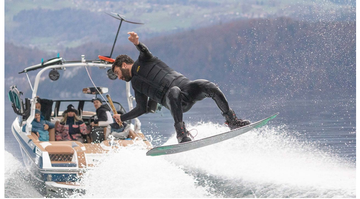
Honu Wassersportcenter