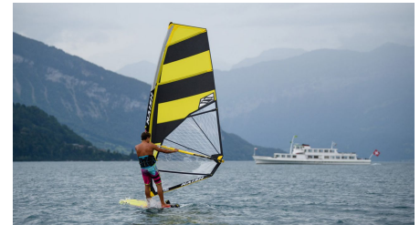
Honu Wassersportcenter