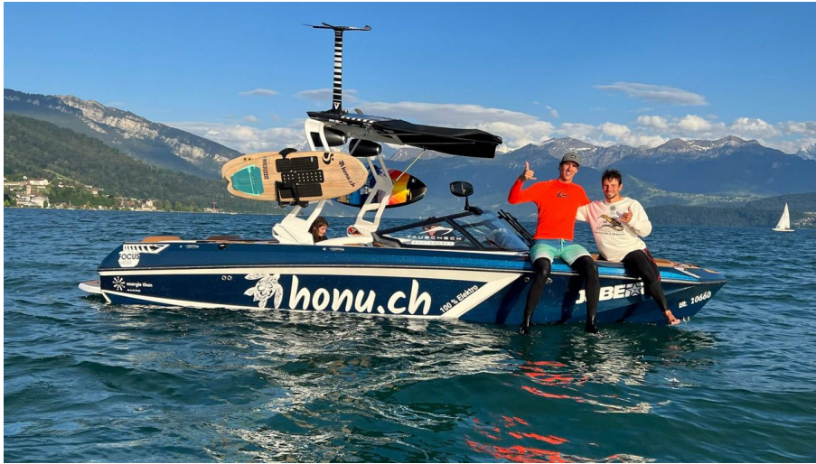
Honu Wassersportcenter, Interlaken Tourismus - web@interlaketourism.ch