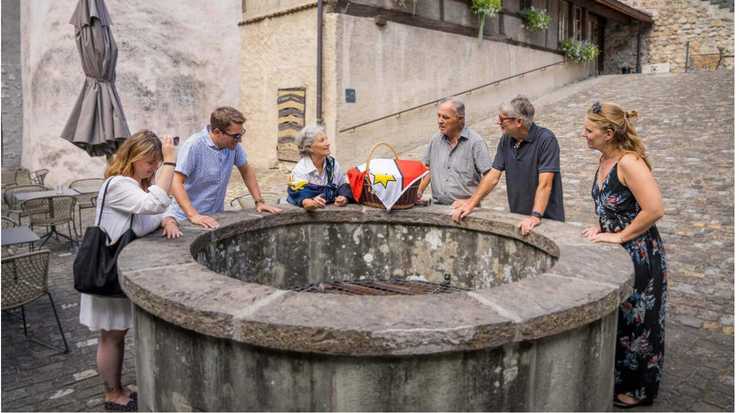
Interlaken Tourismus, Thun-Thunersee Tourismus - web@interlaketourism.ch