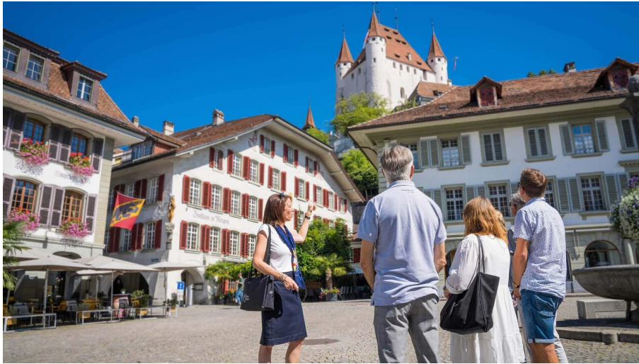
Interlaken Tourismus, Thun-Thunersee Tourismus - web@interlaktourism.ch