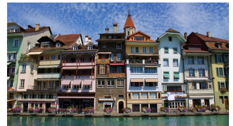
Thun-Thunersee Tourismus, Interlaken Tourismus - web@interlaketourism.ch