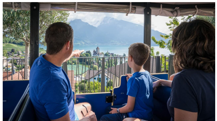
Spiez Marketing AG, Interlaken Tourismus - web@interlaketourism.ch