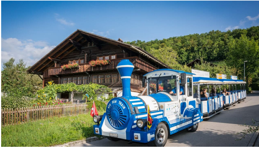
Spiez Marketing AG, Interlaken Tourismus - web@interlaketourism.ch