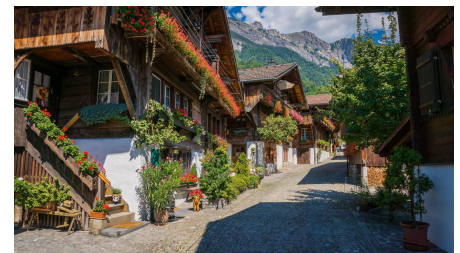
Tourist Information Brienz, Interlaken Tourismus - web@interlaketourism.ch