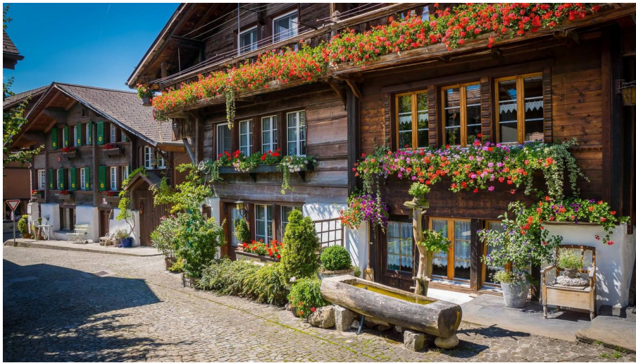
Tourist Information Brienz, Interlaken Tourismus - web@interlaketourism.ch