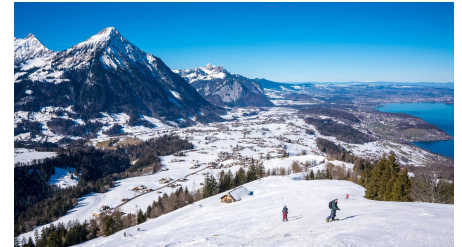
Aeschi Tourismus, Interlaken Tourismus - web@interlaketourism.ch