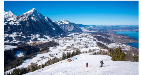
Aeschi Tourismus, Interlaken Tourismus - web@interlaketourism.ch