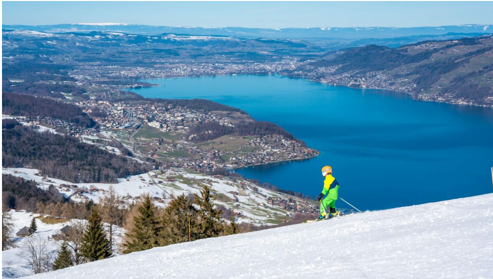
Aeschi Tourismus, Interlaken Tourismus - web@interlaketourism.ch

December – March, depending on the snow conditions