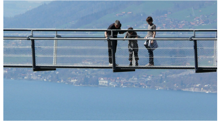
Interlaken Tourismus - web@interlaketourism.ch