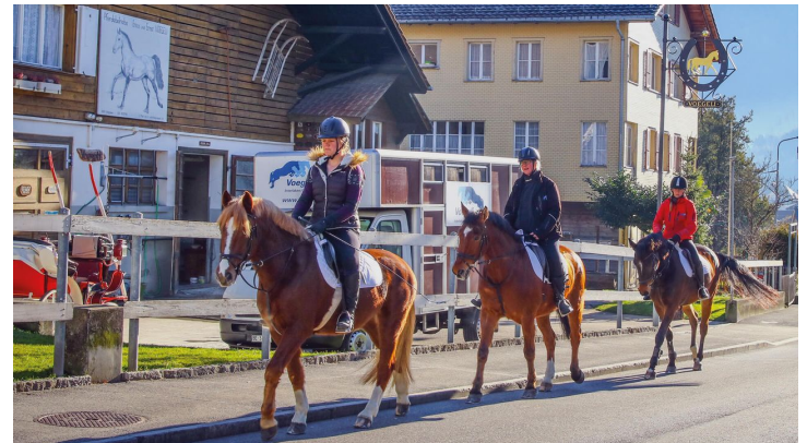
Reitschule Voegeli