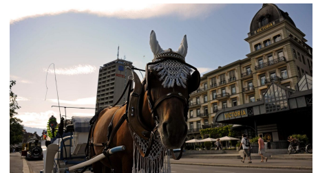
Reitschule Voegeli, Interlaken Tourismus - web@interlaketourism.ch