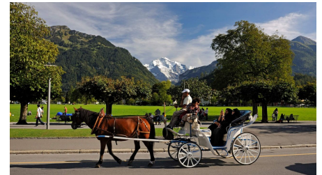
Reitschule Voegeli, Interlaken Tourismus - web@interlaketourism.ch