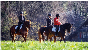
Reitschule Voegeli