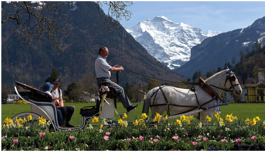
Reitschule Voegeli, Interlaken Tourismus - web@interlaketourism.ch