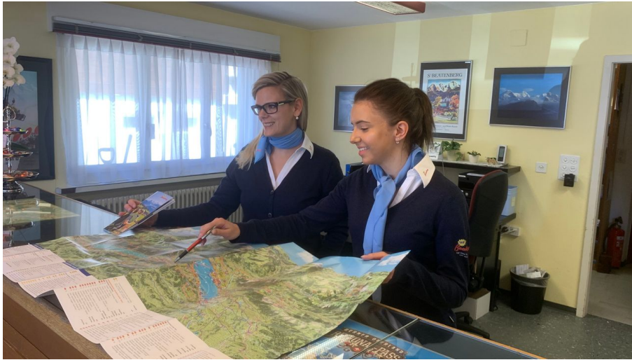
Beatenberg Tourismus, Interlaken Tourismus - web@interlaketourism.ch