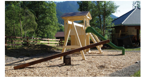
Naturpark Diemtigtal - web@interlaketourism.ch