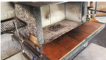
Naturpark Diemtigtal