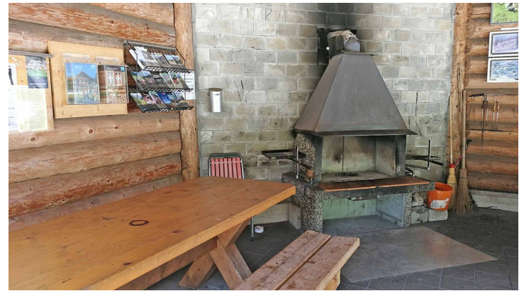
Naturpark Diemtigtal - web@interlaketourism.ch