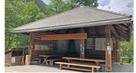
Naturpark Diemtigtal