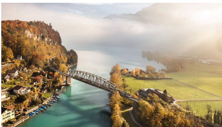
Zentralbahn AG, Interlaken Tourismus - web@interlaketourism.ch