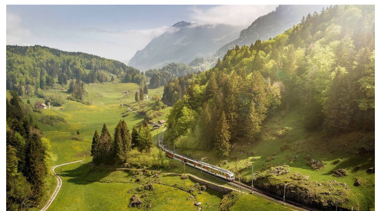
Zentralbahn AG, Interlaken Tourismus - web@interlaketourism.ch