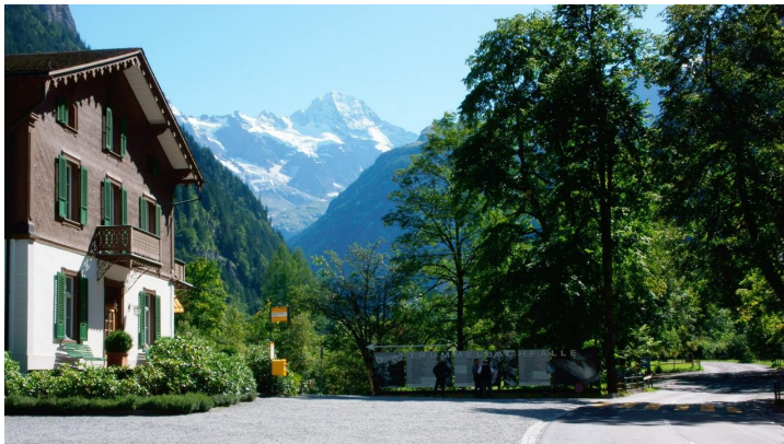
Trümmelbach Gletscherwasserfälle