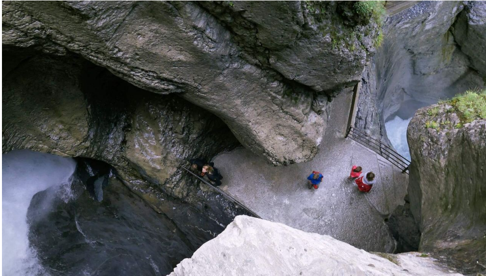
Trümmelbach Gletscherwasserfälle