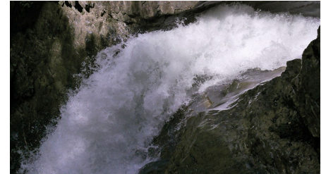
Trümmelbach Gletscherwasserfälle