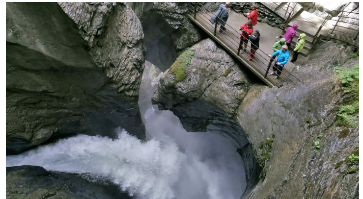
Trümmelbach Gletscherwasserfälle