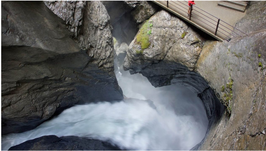
Trümmelbach Gletscherwasserfälle

attractions | waterfalls | places of power | summer