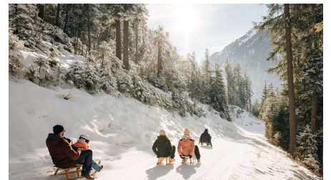
Prepared toboggan run of Wiriehornbahnen AG