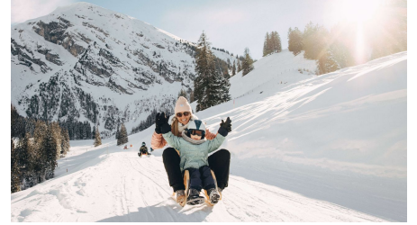
Sledding fun for young and old