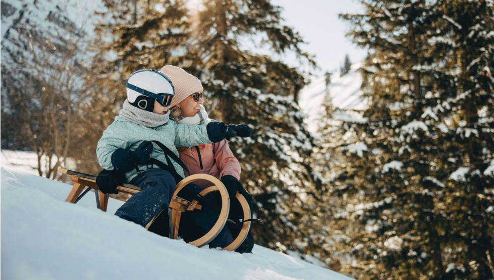
Snow-covered landscapes invite you to sledding fun

Source: destination.one ID: p_100044541 Last changed on 09.04.2024, 12:09