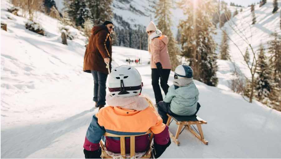
Sledging on the Wiriehorn