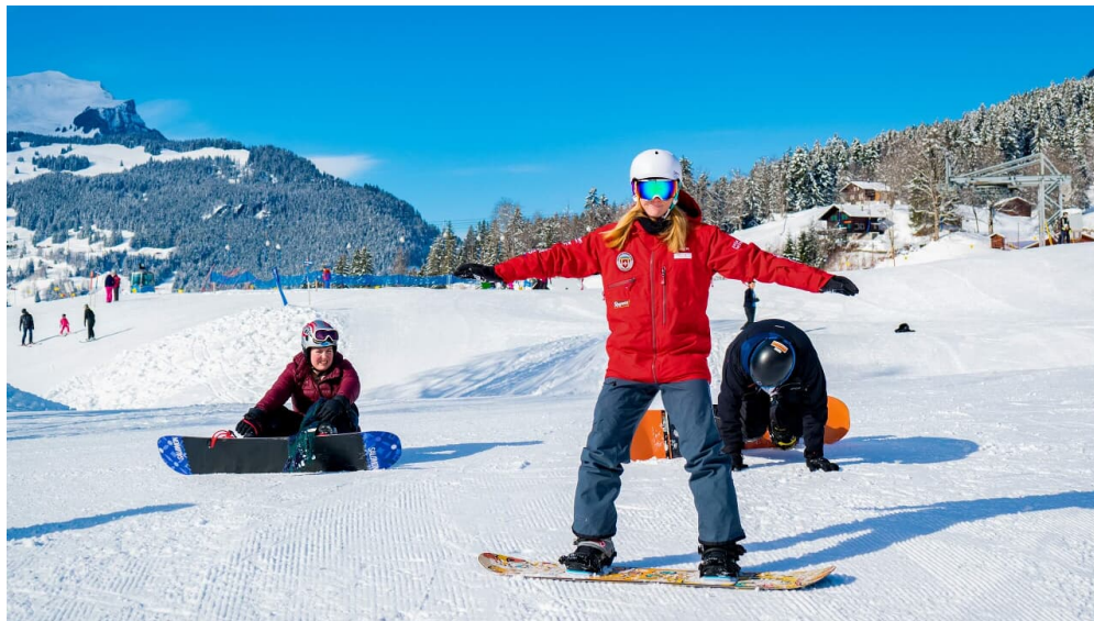
Outdoor Switzerland AG, Interlaken Tourismus - web@interlaketourism.ch