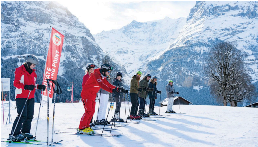
Outdoor Switzerland AG, Interlaken Tourismus - web@interlaketourism.ch