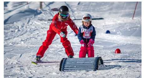
Outdoor Switzerland AG, Interlaken Tourismus - web@interlaketourism.ch